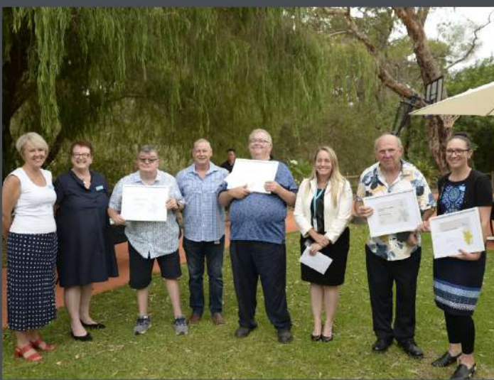
10 to 50 years